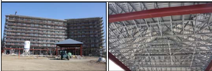
Marriott Courtyard in Campbell used trusses to speed construction of the Porte Cochere. GC: Taisei Construction