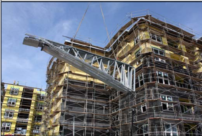
The Crossings in San Bruno had nearly 100,000 SF of roof area and a demanding schedule. Working with Team Panels of Denver CO, Daley's was able to get the roof dried in ahead of schedule. GC: SNK Construction