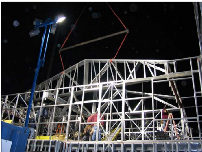
Bay Street in Emeryville: Due to a congested site and the intention to keep the retail stores below open during construction, Daley's set trusses at night. GC: Devcon Construction

Many of our clients are not aware Daley's is a very experienced truss installer, dating back to our first metal truss project on a tract of metal framed homes in Santa Cruz in 1991. In 2005, our experience grew on the Emeryville Bay Street Condo Project. Currently, we are completing The Crossings in San Bruno, our largest truss project to date and have received compliments from a very satisfied developer and contractor. Contact us for your next metal framed and truss project.